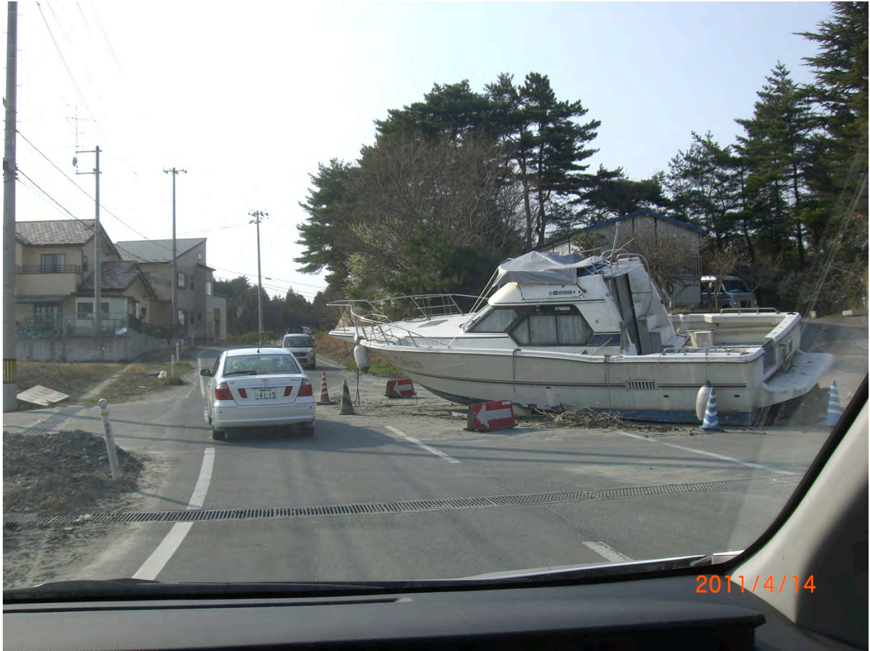
Above: On the way to Soma City